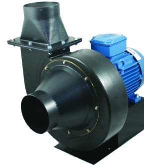
Above: unit shown with motor pedestal, inlet & discharge spigots